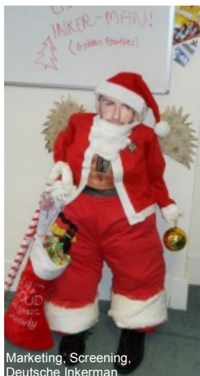
1. Marketing, Screening, Deutsche Inkerman