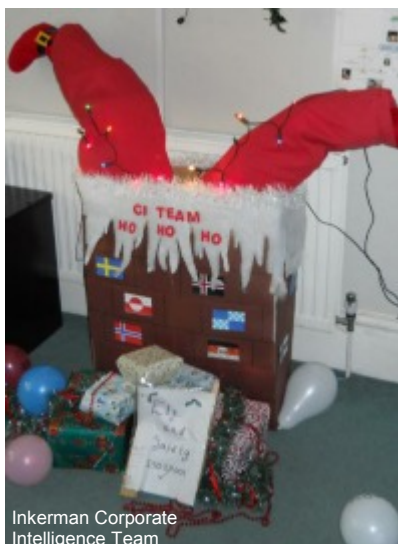
2. Inkerman Corporate Intelligence Team